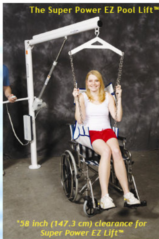
*58 inch (147.3 cm) clearance for Super Power EZ Lift™