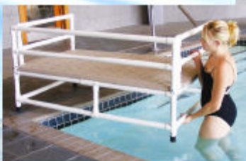
F- 250TTP The Swim Training Platform