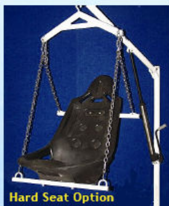
Hard Seat Option