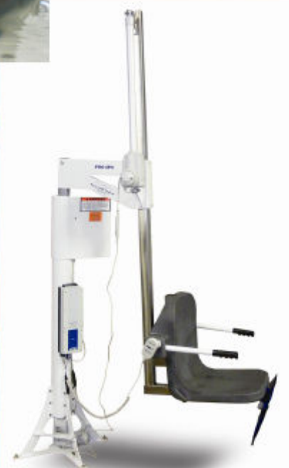
The Pro Spa 60 Lift™