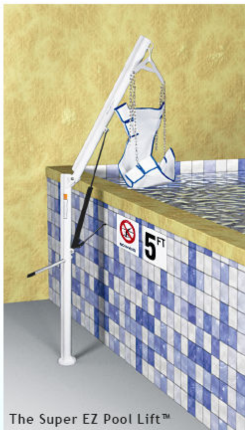
The Super EZ Pool Lift™

The Super EZ Pool Lift™ and Super Power EZ Pool Lift™ are the perfect solution to provide accessibility to above ground pools and spas at an affordable price. Both lifts offer many of the same great features as the EZ and Power EZ Pool Lifts™. With the ability to clear up to a 60* inch (152.4 cm) high wall up to 10 inches (25.4 cm) thick! That's 5 feet high!