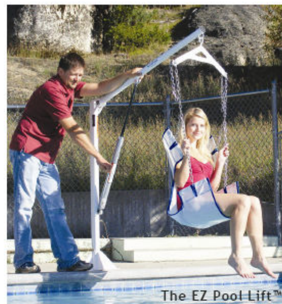
The EZ Pool Lift™

Shown with optional Surface Mount Anchor. This lift is manually operated by a hydraulic ram. The ram is coated with XCR coating to further prevent corrosion.