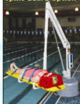
Spine board Option