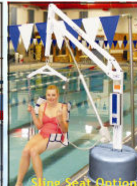
Sling Seat Option