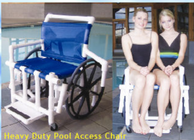
Heavy Duty Pool Access Chair