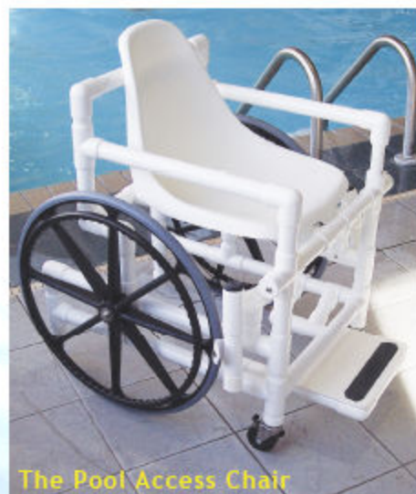
The Pool Access Chair