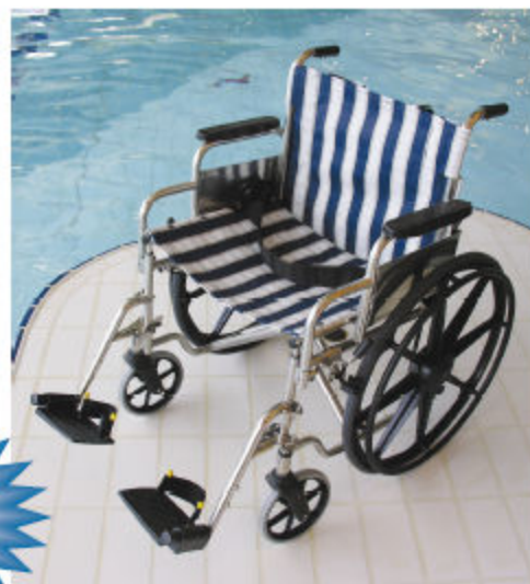
NEW - 22" Rigid Wheelchair