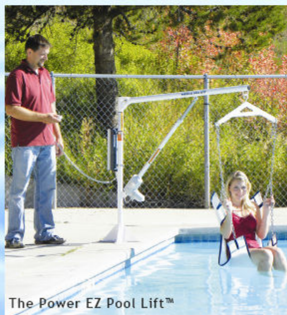
The Power EZ Pool Lift™

Shown with optional Surface Mount Anchor. This lift is operated by a 24 volt battery and comes complete with battery charger.